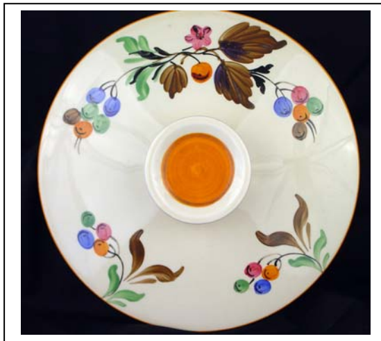
'Oak Leaf' (pattern number 8808)

"Oak Leaf" is a fully free hand pattern that well exhibits the "linear stlye" that characterises a number of Dolly Cliff's patterns.