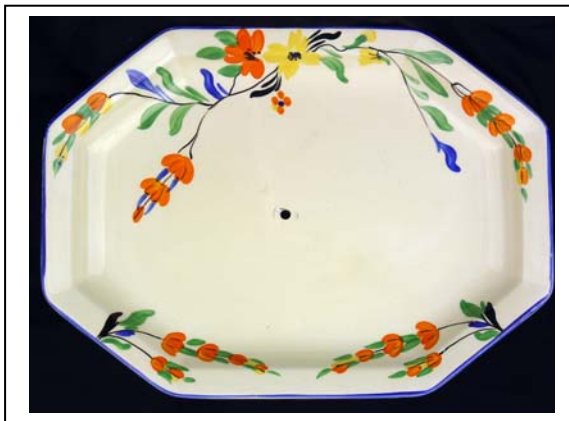
'Orange Blossom' (pattern number 8998)

On flatware, these wings are repeated as partial patterns and give balance to the whole design. When applied to hollowware, such as vases, only the principal design is depicted and is supported by simple bands.